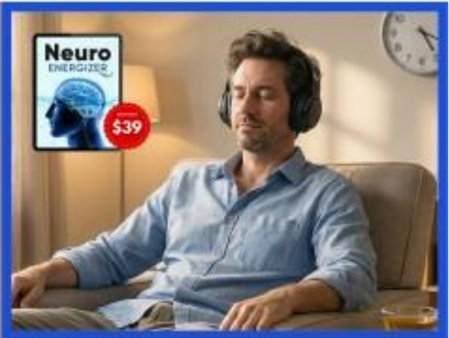
With Neuro ENERGIZER